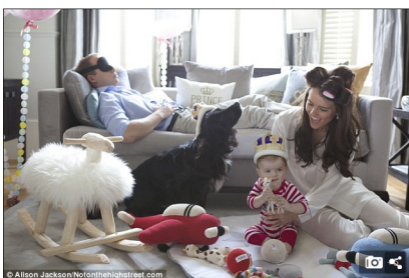
Curl up: Rollers aren't just for being chauffeured in...Kate looks after her hair and her son, while William puts an eye mask on to catch 40 winks

Or at least this is how photographer Alison Jackson imagines next Sunday's celebrations might look.