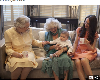
Centre of attention: Camilla is left holding the baby as the Queen and Kate sup tea from mugs with apt slogan 'Mummy rules' in one of the final images

They sup champagne, nibble on canapes and take selfies on their mobiles in what appears to be a very middle-class gathering in the recently refurbished Apartment 1a at Kensington Palace.