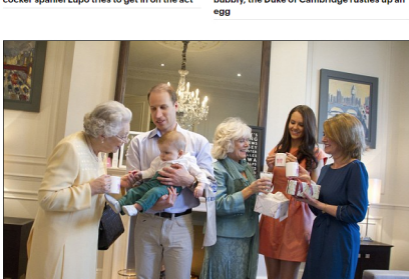
And what do you do? Old habits die hard as the Queen shakes George's hand when the clan gather with tea and gifts

A similar phrase is made into the Twitter hashtag #onerules and printed on to William's mobile phone cover, while other details include personalised cushions stating they are from the 'Cambridge residence'.