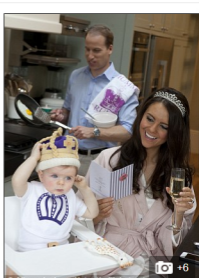
His Royal fryness: As his wife opens her first Mother's Day card with a morning glass of bubbly, the Duke of Cambridge rustles up an egg