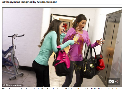
The photographer found lookalikes barely discernible from the original Middleton girls for her jokey shoot