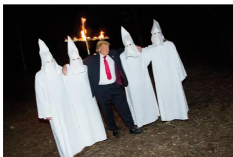
Lookalike Donald Trump with his arms round members of the Klu Klux Klan.

The snaps include Tony Blair doodling on a copy of the Chilcot report, Francois Hollande feeding Angela Merkel a croissant in bed and Nigel Farage uncorking a bottle of champers with Donald Trump.