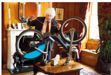
Boris bikes: The Foreign Secretary fixing one of his iconic London bikes.

Other pictures show David Cameron signing a "Sorry I am leaving" card, the Queen tucking into a slice of birthday cake and President-elect Trump surrounded by beauty pageant winners from Syria and Mexico.